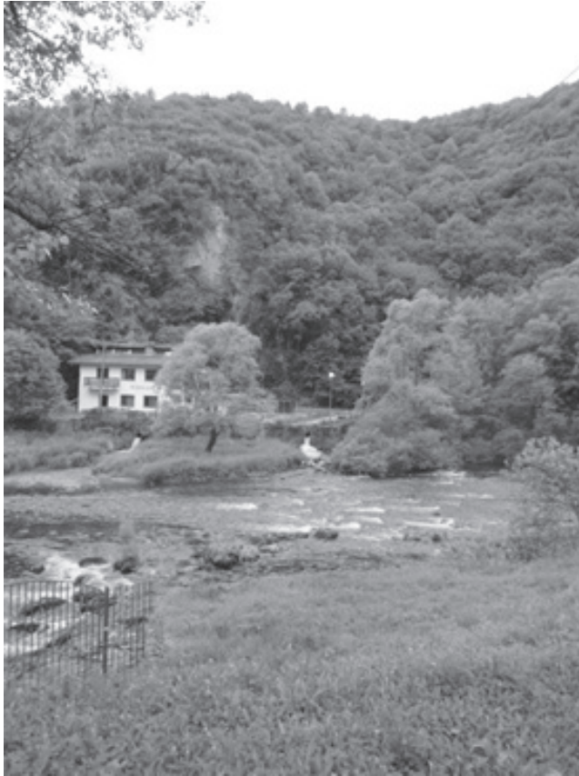
Figure. 7. Klokot spring, which supplies the city of Bihać, is the main source of the Una transboundary karst aquifer (Croatia – Bosnia & Herzegovina) Слика 7. Клокот, карстно врело које снабдева водом Бихаћ, највеће је извориште међуграничне карстне издани Уна (Хрватска – БиХ)

Similarly, the analysis of actual water use versus the total available dynamic groundwater reserves for tested karst aquifers, conducted on the territory of the Federation of Bosnia and Herzegovina in the Sava River basin, confirms that with most of the aquifers just a small portion of the available waters is actually used (Stevanović et al., 2015). For instance, in karst groundwater body “Upper Una” – only 10%, and in “Upper Sana” – less than 5% of renewable (dynamic) reserves is currently utilised.