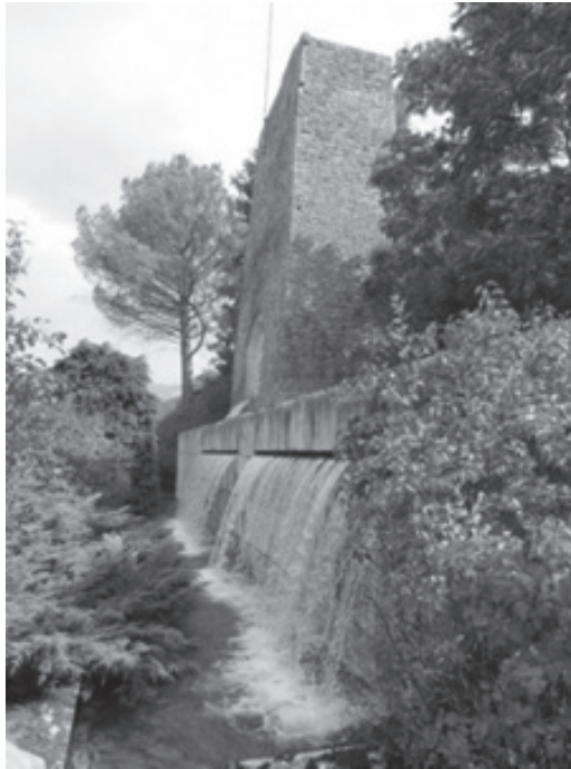
Figure 2. Overflow at the Peschiera spring (Velino Basin), tapped to supply the city of Rome

Many other cities and tourist centres along the Adriatic, Ionian and Aegean coasts are also consumers of karstic groundwater (Stevanović & Filipović, 1994; Milanović, 2005; Radulović, 2000; Stevanović & Eftimi, 2010; Fiorillo & Guadagno, 2012; Kallioras & Marinou, 2015). The cities of Southern Italy – Naples, Bari and many others – utilise large springs such as Caposele ( Q_{av.} = 4 \text{ m}^3/\text{s} ), Serino ( Q_{av.} = 2.2 \text{ m}^3/\text{s} ); the largest spring on the northern Italian coast, Timavo, with an average discharge rate of 30 \text{ m}^3/\text{s} , supplies water to Trieste; Rižana near Koper ( Q_{av.} = 4.3 \text{ m}^3/\text{s} ) is the main source for supplying water to Slovenia's coastal zone; the Žvir group of springs ( 0.6\text{--}3.0 \text{ m}^3/\text{s} ) supplies water to Rijeka, the largest Croatian port; while Jadro Spring ( 3\text{--}50 \text{ m}^3/\text{s} ) is the main source for the water supply of Split. Ombra Spring is the largest permanent karstic spring in the Southern Adriatic ( Q_{min} = 2.3 \text{ m}^3/\text{s} ), supplying water to the city of Dubrovnik.