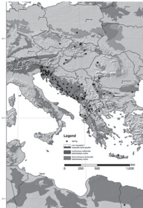
Figure 6. Dense distribution of karstic springs in the Dinaric part of the SE Europe on one of draft WOKAM maps (from Stevanović et al., 2016)

Within the DIKTAS project (Dinaric Karst Transboundary Aquifer System), the evaluation of water budget and actual water use comprise eight main transboundary karst aquifers (TBA): Una (Fig. 7), Krka, Cetina, Neretva, Trebišnjica (all shared by Croatia and Bosnia and Herzegovina), Bilećko Lake, Piva (B&H and Montenegro) and Cijevna/Cemi (Montenegro and Albania). The analysis indicates that water extraction is still far below the aquifer's replenishment potential, and there is no evidence of significant over-exploitation in the studied TBAs (Stevanović et al., 2016). For instance, in the case of Cetina and Neretva TBAs, the average extraction of groundwater is ten times lower than the total minimal discharge of the local springs (dynamic reserves). However, shortage of water is evident locally during summer and early autumn months, coinciding with increased demands caused by the tourist season.