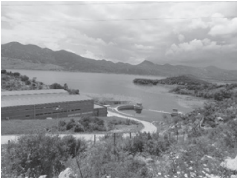
Figure 3. Bolje sestre source at the Skadar Lake shoreline, which now supplies the entire Montenegrin Coast