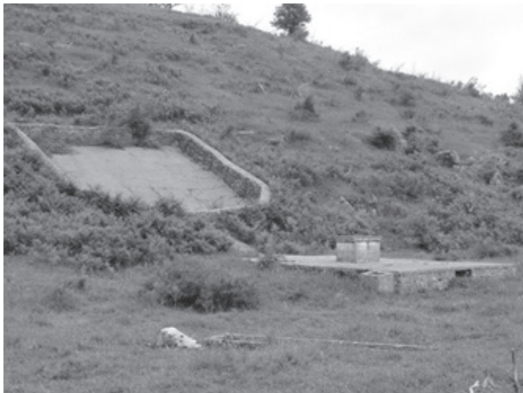
Figure 4. A typical cistern – reservoir for rainwater in the high mountain of Vojnik, between Nikšić and Šavnik (Montenegro) Слика 4. Типична цистерна – резервоар кишнице на планини Војник, између Никшића и Шавника (Црна Гора)

groundwater table is often very deep, with no available surface waters. The only way to provide water to the local villagers and their livestock is to build cisterns and specific intakes for collecting rainwater (Fig. 4).